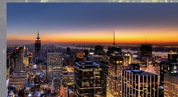
New York City, NY

competition. There are many opportunities to see Providence, Newport and other locales while here. A tour of New York City and Ground Zero has also been a highlight of the visitor's itinerary.