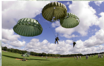
Teams attempting to hit the target "X"

There is a tremendous amount of tradition and Esprit de Corps which surround Leapfest. From its beginning, the event is first and foremost grounded on fostering respect and camaraderie among the various competitors from around the world. What underscores this event as truly