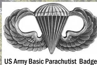
US Army Basic Parachutist Badge

International competitors are awarded the U.S. Army Parachute Badge upon completing the appropriate training and parachute descents. Each competitor must have jumped using a U.S. Army parachute from a U.S. Army aircraft and having been released by a U.S. Army Jumpmaster.