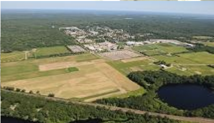
Aerial view of Pick Up Zone, Kingston RI

The Leapfest competition team is comprised of five (5) personnel: four (4) jumpers and one (1) alternate. Jumpers will exit from a CH-47 Chinook helicopter from 1500 feet (AGL) using the MC1-1D static line steerable parabolic parachute. Each stick consists of four jumpers. The complete rules are provided at the mission briefing.