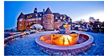
The Towers at Narragansett, RI

International teams enjoy the surrounding sights and sounds during their stay in Rhode Island. The Welcome Reception is held at the historic Towers in scenic Narragansett Beach. The Leapfest Awards Banquet is held at a local venue on the same evening as the