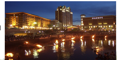
Waterfire in Providence, RI

International teams enjoy the surrounding sights and sounds during their stay in Rhode Island. The Welcome Reception is held at the historic Towers in scenic Narragansett Beach. The Leapfest Awards Banquet is held at a local venue on the same evening as the